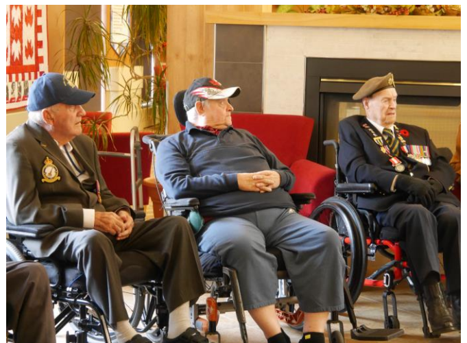
Kipnes Centre veterans wait for an escort to the RCAF Commemorative Park ceremony