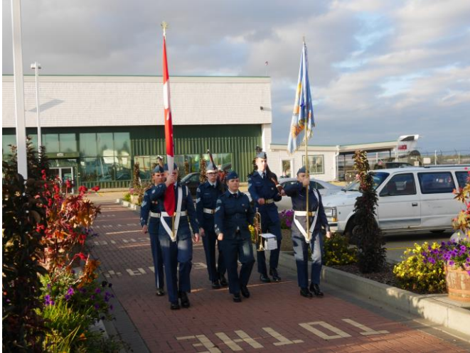
504 Sqdn Colour Party marches on for the Aviation Heritage Memorial Stone Dedication Ceremony