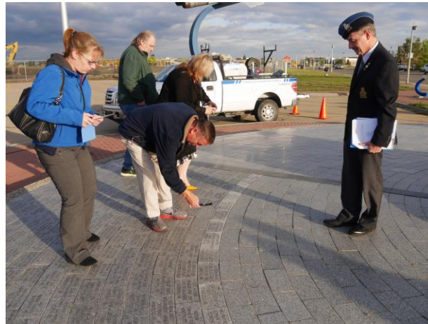
Family members capturing memories from the Memorial just prior to the ceremonies.