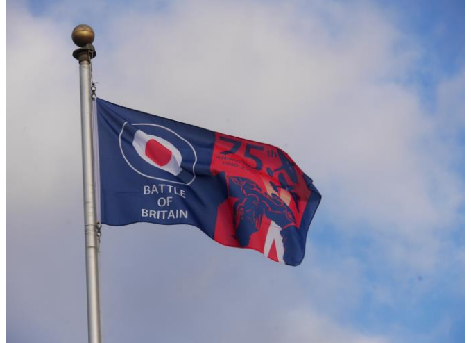
The 75 th Anniversary Battle of Britain Flag flies proudly over the Aviation Memorial during the Battle of Britain Parade