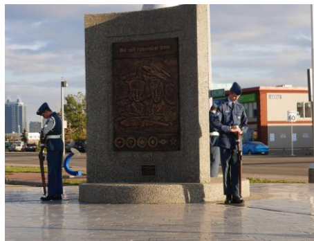
Cadets on sentry post on the Aviation Heritage Memorial during the ceremony