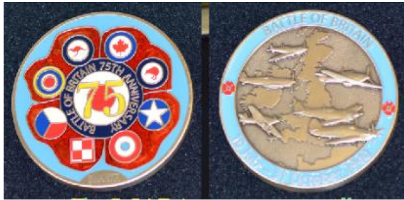
This is the front and back of the new commemorative 75 th Anniversary Battle of Britain coin now on sale from our Treasurer.

There are still several 75 th Anniversary Battle of Britain coins left in the Wing inventory if anyone would still like to obtain them. These were from the last batch of coins from the Royal Canadian Air Force