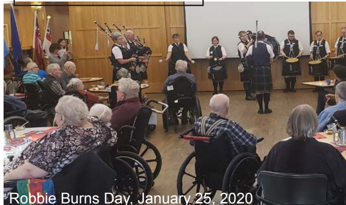
Robbie Burns Day, January 25, 2020