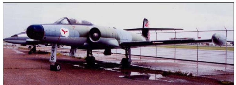
CF-100 Mk 5D (18476) former CFB Namao and No. 414 Electronic Warfare (EW) Squadron #100476 painted as No. 440 Squadron RCAF Mk 4B serving in NATO and on display at the Alberta Aviation Museum.