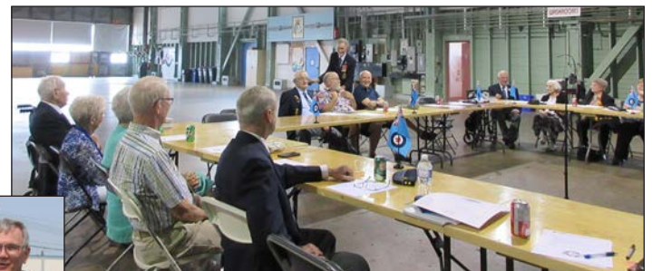
700 Wing Annual AGM 2023