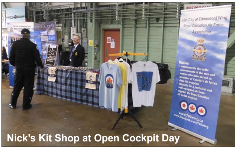
Nick's Kit Shop at Open Cockpit Day